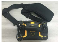
Straps and Touch pen