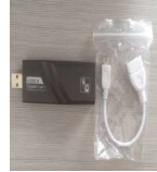
OTG device USB-LAN RJ45